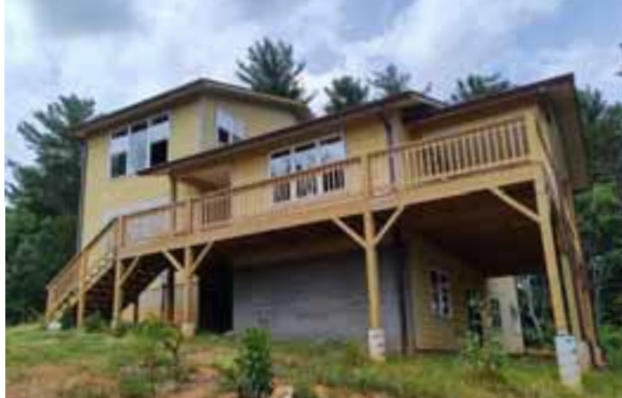
We now have siding, decks and windows! Can you help out with costs of insulation and drywall?